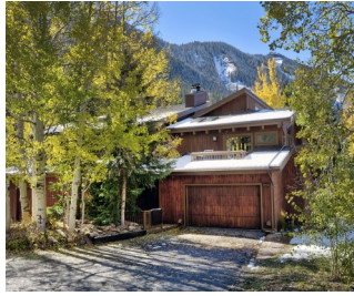
Under Contract by East Vail Team 4999 Main Gore Drive #A $1,245,000 - asking price 4 bedrooms & private location