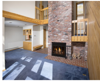
Under Contract by East Vail Team P-3 Racquet Club Townhome $725,000 - asking price 3 bedrooms & sunny location