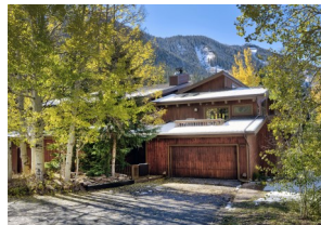
Under Contract by East Vail Team 4999 Main Gore Drive #A $1,245,000 - asking price 4 bedrooms & private location