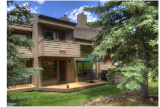
Sold by East Vail Team 38 Courtside $1,100,000 - sold price 3 bedrooms & private setting