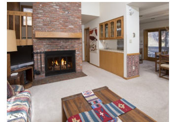
Sold by East Vail Team I-2 Racquet Club Townhome $674,500 - sold price 3 bedrooms & corner location