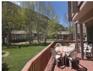
Sold by East Vail Team A-4 Bighorn Townhome $737,000 - sold price 3 bedrooms & mountain