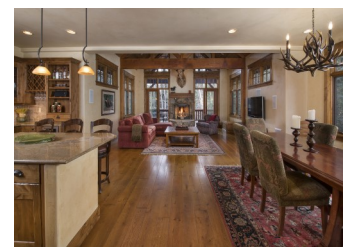
Sold by East Vail Team 4346 Spruce Way $2,146,000 - sold price 4 bedrooms & creek location