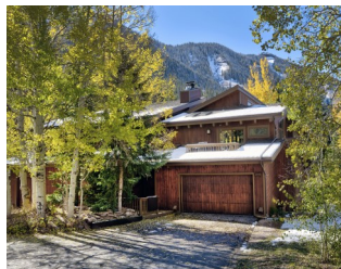
Under Contract by East Vail Team 4999 Main Gore Drive #A $1,245,000 - asking price 4 bedrooms & private location