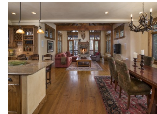
Sold by East Vail Team 4346 Spruce Way $2,146,000 - sold price 4 bedrooms & creek location