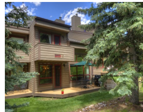
Sold by East Vail Team 38 Courtyard $1,100,000 - sold price 3 bedrooms & private setting