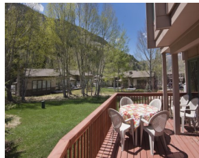
Sold by East Vail Team A-4 Bighorn Townhome $737,000 - sold price 3 bedrooms & mountain views