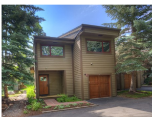
Sold by East Vail Team 44 Courtyard $950,000 - sold price 3 bedrooms & attached garage