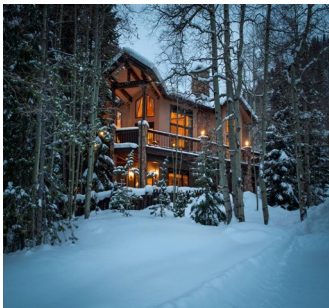
Listed by East Vail Team 4440 Glen Falls Lane $2,730,000 - asking price 4 bedrooms & private location