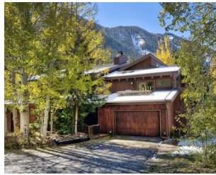
Listed by East Vail Team 4999 Main Gore Drive #A $1,385,000 - asking price 4 bedrooms & private location