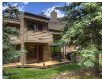
Sold by East Vail Team 38 Courtyard $1,100,000 - sold price 3 bedrooms & private setting