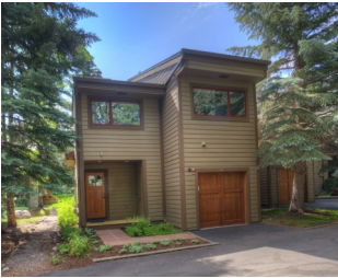
Sold by East Vail Team 44 Courtyard $950,000 - sold price 3 bedrooms & private setting