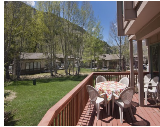
Sold by East Vail Team A-4 Bighorn Townhome $737,000 - sold price 3 bedrooms & mountain views