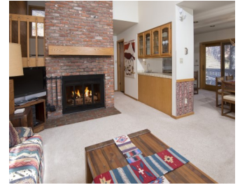
Sold by East Vail Team I-2 Racquet Club Townhome $674,500 - sold price 3 bedrooms & corner location