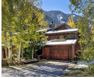
Listed by East Vail Team 4999 Main Gore Drive #A $1,385,000 - asking price 4 bedrooms & private location