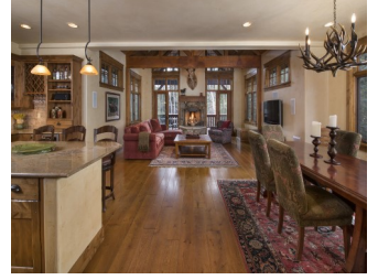
Sold by East Vail Team 4346 Spruce Way $2,146,000 - sold price 4 bedrooms & creek location