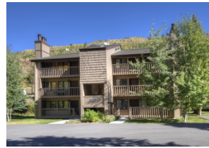
Sold by East Vail Team #10 Vail East Townhouse Condos $593,000 - sold price 3 bedrooms & mountain views